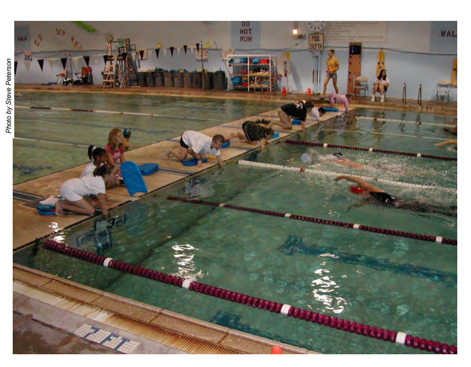
Lap counters, many of them PSSC age-group swimmers, doing a great job at the South Kitsap High School pool.