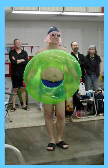
ORCA member ready and fully equipped for the inner tube leg of the famed Pink Flamingo Relay