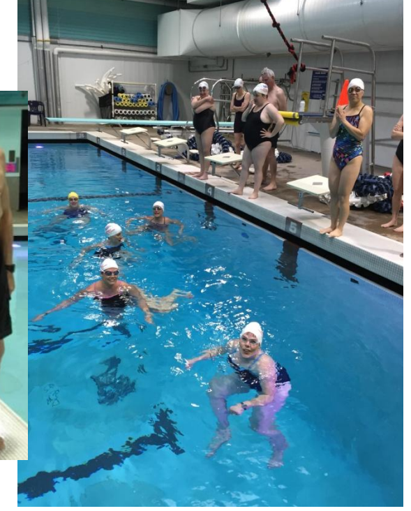
And we had to tread water AND swim 25 yards as part of the final test!