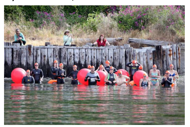
Swim Defiance 3K race competitors in-water start on the Vashon side.

On Sunday, June 21, 2015, 46 courageous and indomitable swimmers braved the 54° waters of the Puget Sound as they recreated that historic open water race swam by thirteen hardy souls in 1926!