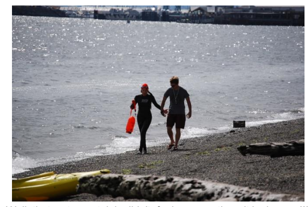
Well, that water certainly didn't feel as smooth as it looks now!!!