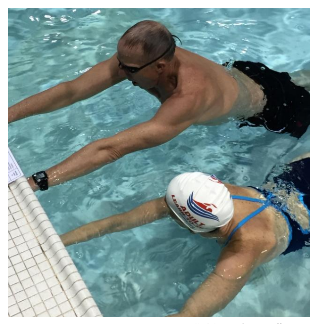
Teaching the 'Front Flutter Kick' on the wall