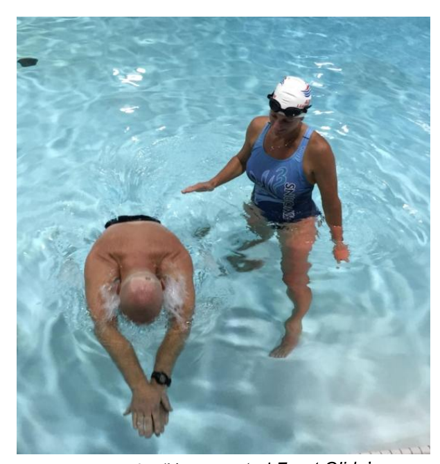
Teaching the 'Unsupported Front Glide'