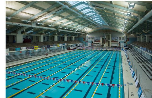
National meet venue