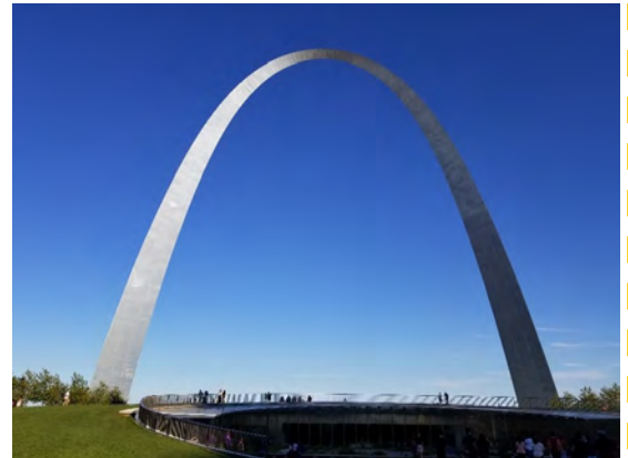
Gateway Arch (the Space Needle would fit beneath it by 25 feet)

PNA's convention policies allow for each delegate to be reimbursed for registration, airfare, ground transport, and half the room expense. Fortunately, certain roles at the national level are funded entirely by USMS. Even so, this year's convention expense for PNA totaled approximately $10,000, which is a budgeted expense. A proposal from the National Office, the "Unified USMS Membership Fee Concept," may bring a change to convention delegate funding in a couple years (see more details below).