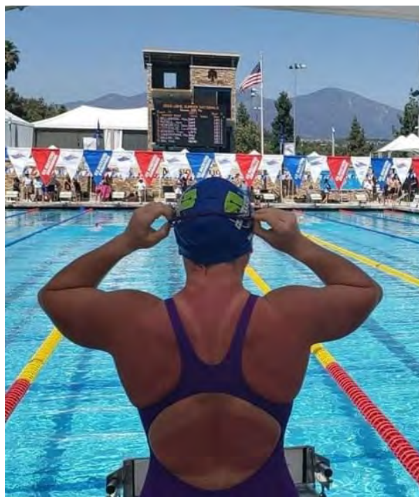
At summer nationals.