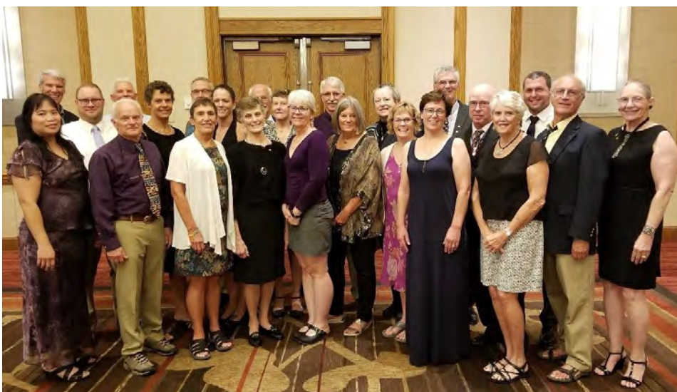
Northwest Zone delegates

Significant changes to convention procedures in recent years – like any good coaching – have concentrated on better streamlining of the body. Rule Book amendment proposals are no longer divided between "wet" and "dry" in alternate years. Of the 17 Rules ("wet") proposals this year, 13 were adopted. Of the 14 Legislation ("dry") proposals, 10 were adopted. Long Distance had the most proposed at 29; 1 was tabled and 27 were approved (including 23