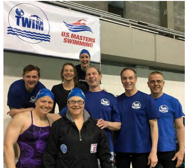
With TWIM teammates.