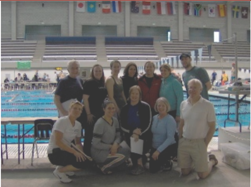
The PNA Coaches Committee, which meets regularly to share information, met at the recent PNA SCY Championships in Federal Way