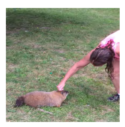
Parc Jean-Drapeau's resident groundhog loves tourists

"The positives were that the pools were good, the heats ran on time and the competitors were from all over the world. I don't know many other ways to compete against swimmers from places like Germany, the Ukraine and Peru. One of the US swimmers was counting how many