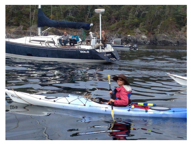
The support crew makes it all possible