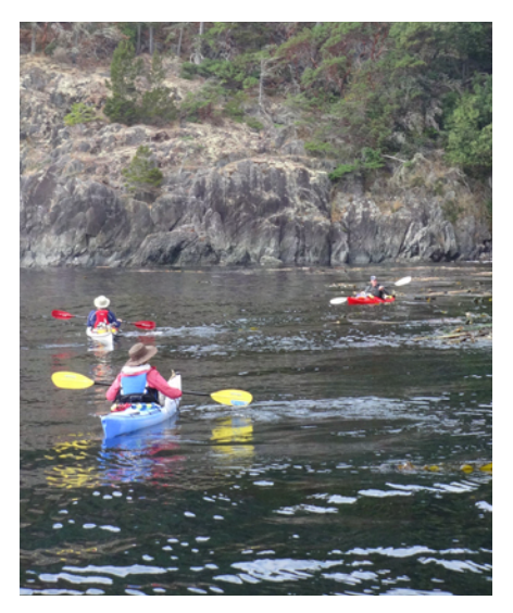
Making for the Canadian shore

And for a <u>blow-by-blow report</u> on the day, see these news reports that gave updates throughout the swim.