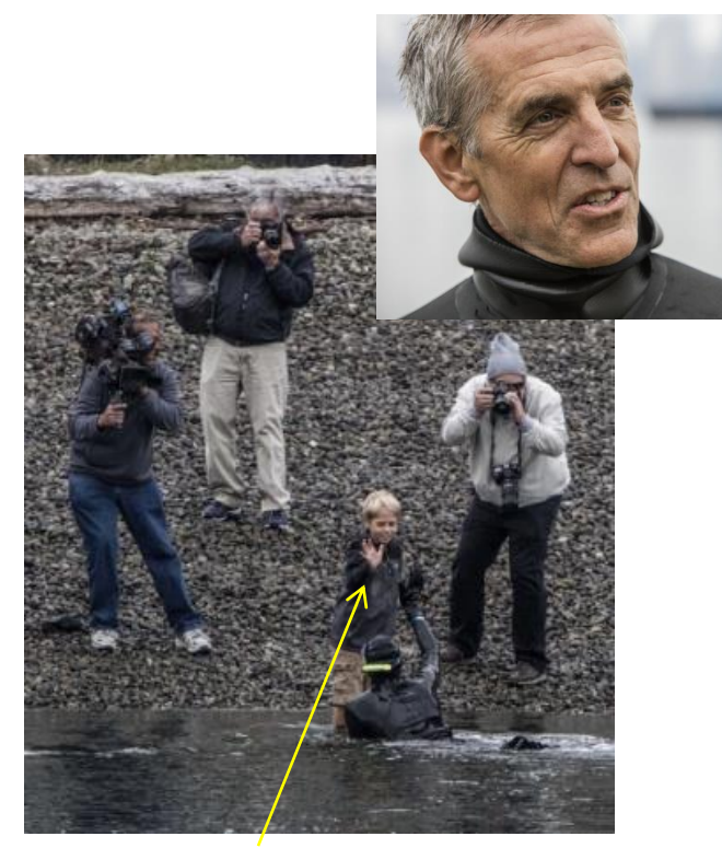
High Five at Finish!