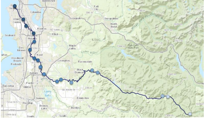
Courtesy of Lynda V. Mapes. See link for full article: <u>www.seattletimes.com/seattle-news/man-swims-55-miles-of-</u> <u>duwamish-river-finds-its-still-alive//</u>