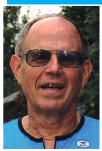
June 22, 1945– September 9, 2015 (70)