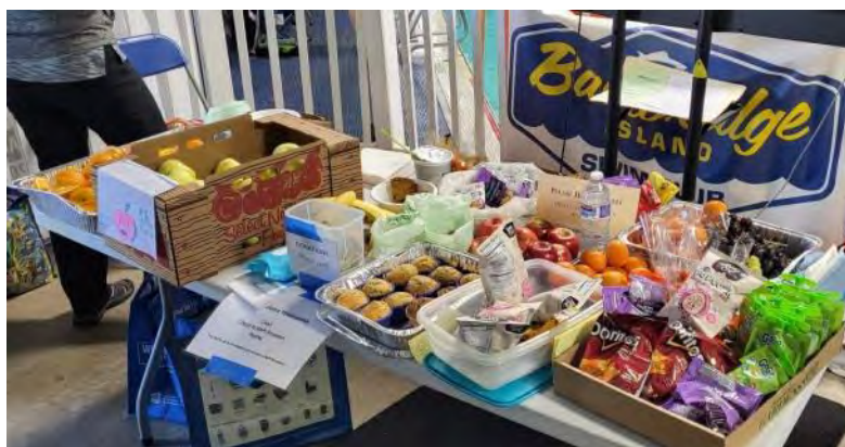
The BAM hospitality table

Results for swimmers in both meets can be found on the PNA website and on Meet Mobile (search for "TACM Fall Kick-Off SCM" and "BAMFest 2024").