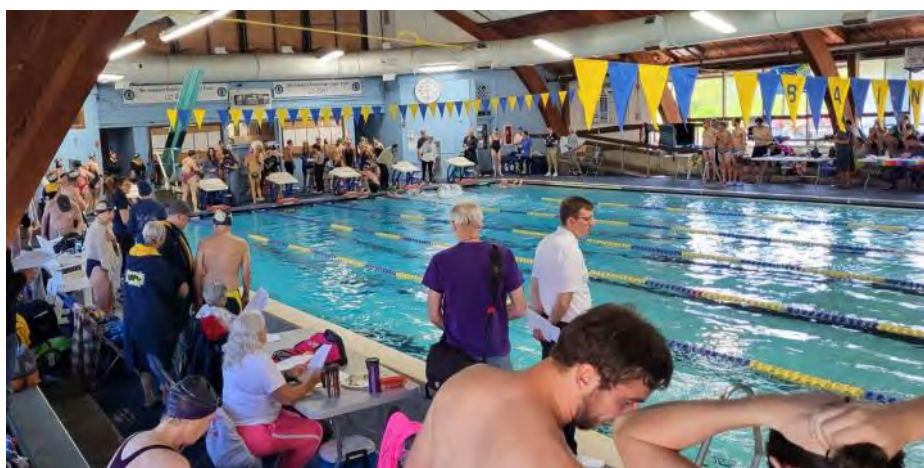
End of the Mixed Medley Relay