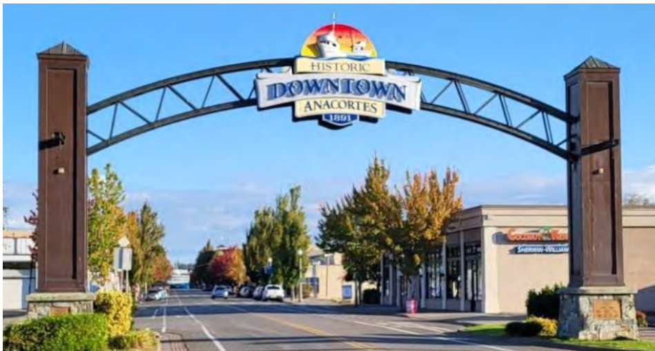
Anacortes Downtown Arch

The Fall Kick-Off's swimmers represented six clubs, including Oregon, Inland Northwest, and Canada's Dolphins and