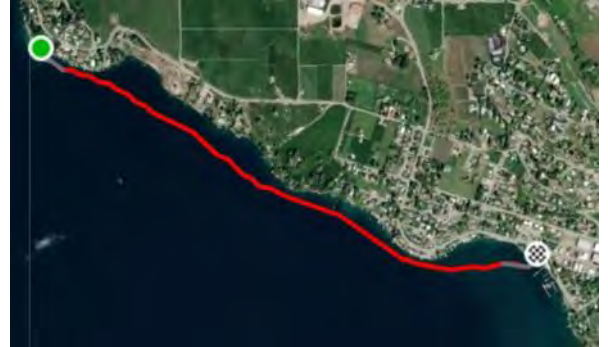
The route from Willow Point to Manson Bay Park

The annual Lake Chelan Swim ( www.lakechelanswim.com ) always takes place the first Saturday after Labor Day. The 14th running of this 1.5-mile swim was on September 7. The swim starts at Willow Point Park and ends at Manson Bay Park on the north shore of Lake Chelan. It's not USMS recognized or sanctioned but is "a fun event suitable for the whole family" that raises funds to subsidize free swim lessons for all ages all summer at Manson Bay Park.