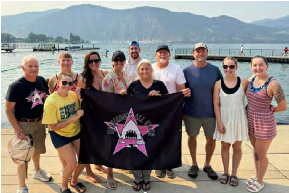
The Bernardo's All Stars contingent at the 2024 Lake Chelan Swim fundraiser.

BERN's Friday evening putt-putt golf tournament and Saturday afternoon barbeque are becoming tradition. Come along for a weekend stay in Lake Chelan for next year's swim, September 6!